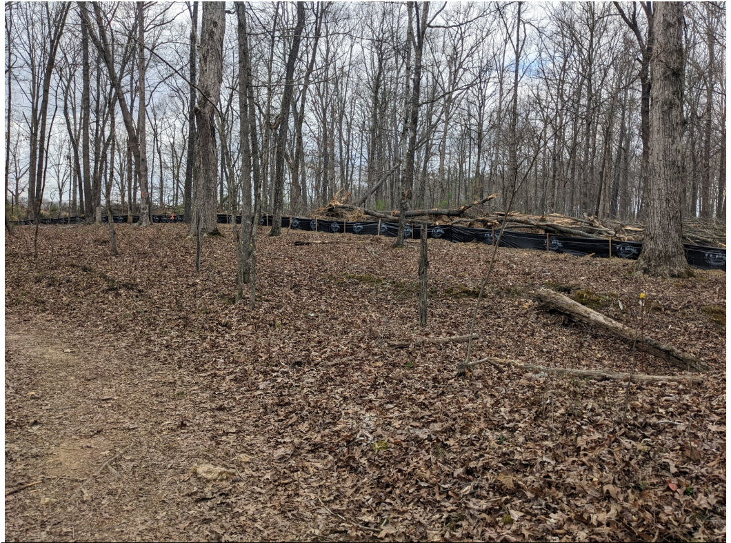
Groves construction site as seen from the perimeter trail in Bowie Park

Two construction sites adjacent to Bowie Nature Park are currently active. The City Center site has a main entrance on Highway 100. Part of its southern boundary forms part of Bowie Park's northern boundary. The Groves parcel connects to the City Center site, and is also adjacent to Bowie Park's northern boundary. The City Center is planned to be a multi-use development with retail and office space as well as multi-unit housing and single-family housing. The plan for the Groves parcel includes 160+ single-family homes on lots ranging from 1/4 acre to 1/2 acre. Pre-construction clearing has begun. Both sites are currently being accessed mainly through the City Center entrance on Highway 100.